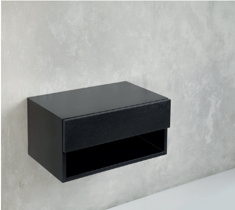
dade ELINA 60, open at the bottom