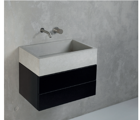
dade ELINA 60 with dade ELEMENT 60

In line with the dade concrete washbasin collections, a matching piece of furniture was developed – the dade ELINA . The washstand designed by the dade architects originates from a collaboration with Timberline and is available in three sizes. Black MDF contrasts perfectly with the grey of the concrete basin – the design is sober – the workmanship of high quality. The 15cm high drawers hit on the cover plate and reflect the design of the 15cm high concrete washbasins. The washstand is available with a single drawer and an open compartment for towels etc. or two drawers. dade ELINA is 40cm deep and available in widths of 60, 90 or 120cm.