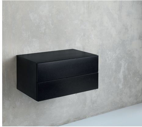
dade ELINA 60