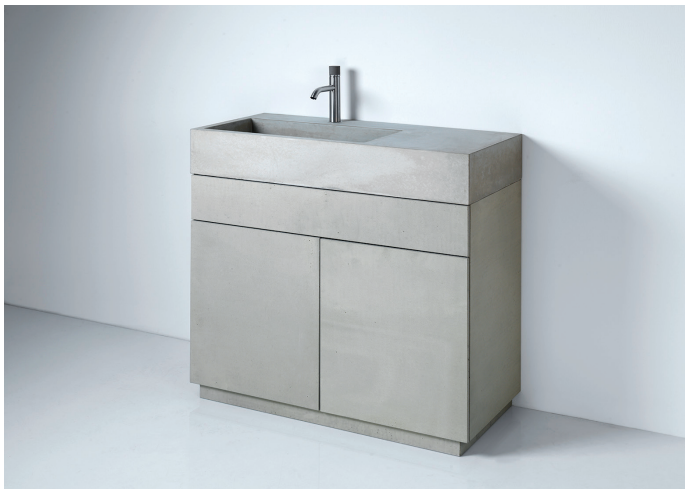
dade ELINA 90 cabinet with dade CASSA 90m