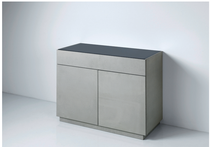
dade ELINA 90 cabinet